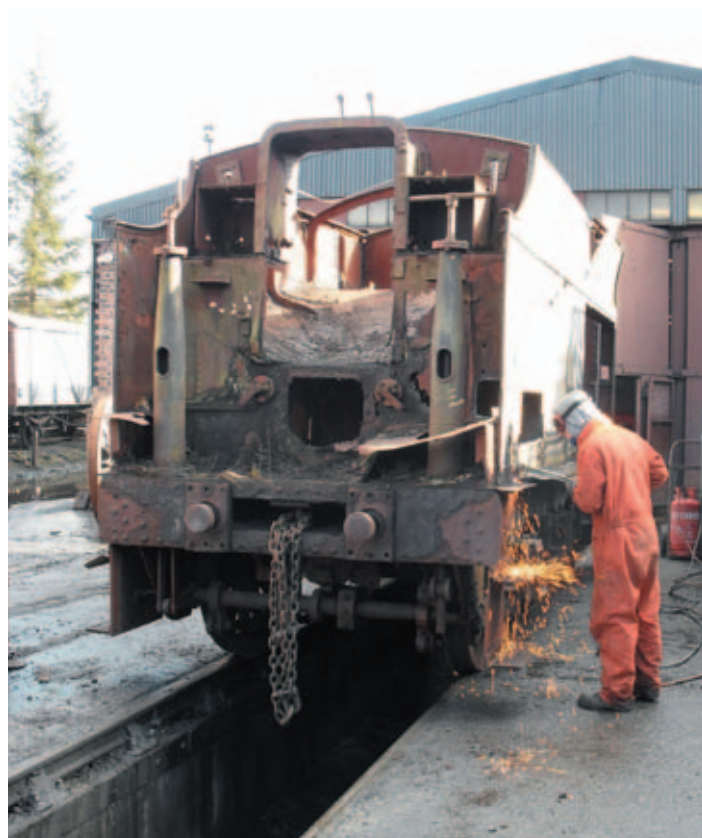
The Fowler tender acquired from the ELR being stripped at Llangollen during February 2013.