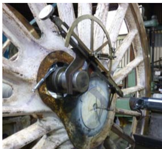
2. Quartering of new Patriot driving wheel at South Devon Railway Engineering.