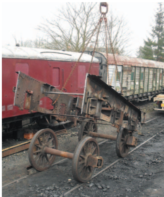
Tender frames from the Fowler tender acquired from the ELR before being sent away for shot blasting. The two wheelsets are spare, as the Project is using the three tender wheelsets from the Fowler tender acquired from Barry.