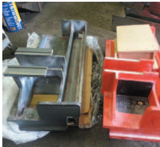
1. Frame Stretcher number 5 and the pattern that was made to cast it.