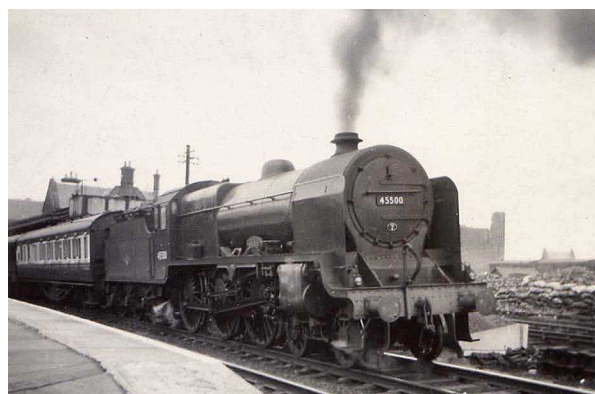
45500 'Patriot' is seen at Penrith, circa late Spring early Summer 1958.