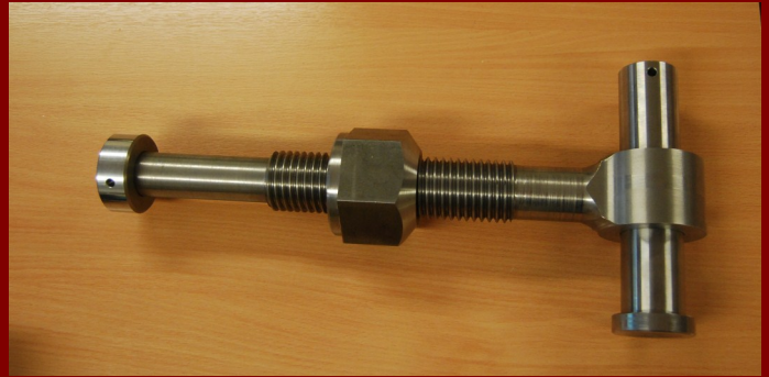
Newly machined spring hanger and spring hanger pin.