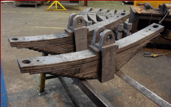
Two of the new driving wheel springs.