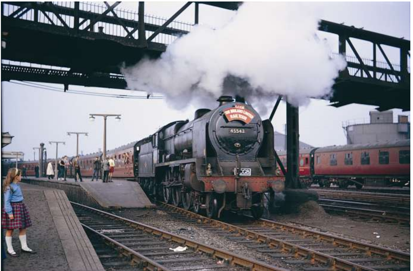
45543 'HOME GUARD' is seen at Derby (Midland Station) on 14th October 1962 on an LCGB railtour 'The Midland Limited'. This tour started at London Marylebone and visited Nottingham Victoria. 45543 worked the leg from Derby to Northampton Bridge Street.

We will be having our Sales Stand on the platform at Llangollen during the Gala, and all Members are invited to come and support the Project and the Llangollen Railway at 'The Corwen Patriot Gala'. We hope to see you there.