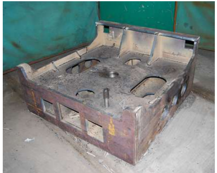
The newly constructed dragbox is seen at the Llangollen Railway Works during December 2009, before being sent away for heat treatment.

Further progress has now been made obtaining drawings, with the discovery of the entire collection of drawings produced by the North British Locomotive Company of Glasgow for the 'Royal Scot' class, in the Glasgow University Archive. The drawing lists for the Royal Scot, 'Patriot and Jubilee classes have also been obtained from the NRM at York. These will allow us to compare the drawings produced for the three classes to establish which of these were common between the three classes. If parts are found to be common between the 'Scot' and 'Patriot' we can obtain copies of the original drawings that were produced by the NBL. If drawings cannot be found for the 'Patriot' components