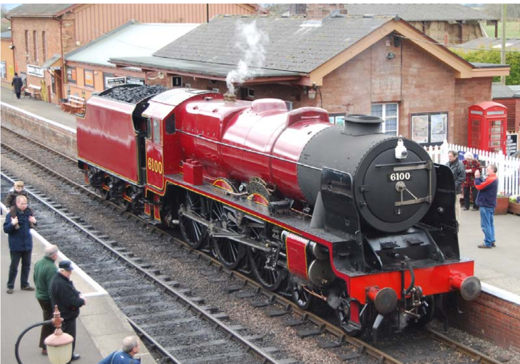
6100 'Royal Scot' is seen at Bishops Lydeard on the West Somerset Railway, on 27 th March 2009, before working the 3pm service to Minehead. Note that the tender had yet to receive 'LMS' lettering.