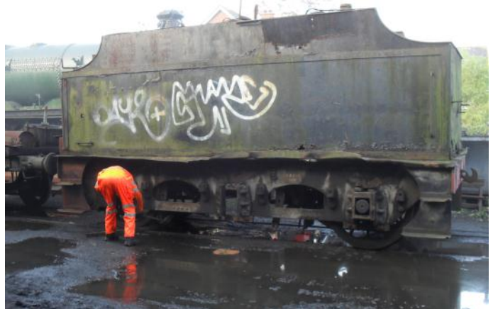
Fowler tender being unloaded in the Goods Yard car park and seen after arrival on Llangollen's metals.