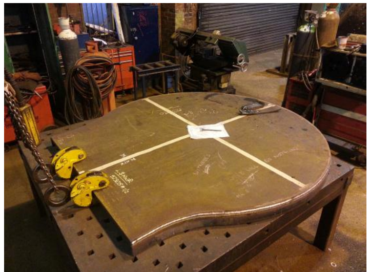
Smokebox wrapper and tube plate for the boiler for 'The Unknown Warrior' are seen on November 9th at LNWR Crewe.