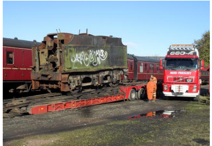
Fowler tender being loaded at Bury on November 5th.

The Fowler tender that has been purchased from the East Lancashire Railway at Bury was delivered to Llangollen on 5th November. The tender, the second ex Barry scrapyards Fowler tender to be obtained by the Project will be stripped at Llangollen and the frames assessed for possible use with 'The Unknown Warrior'. Parts from the first tender which was dismantled at Barry in December 2010 will be used including the refurbished wheelsets, refurbished springs, brake parts and two of the axle boxes. A new tender tank will be made slightly wider than the original to give an increased water capacity which is advantageous for mainline running, while still keeping the distinctive look of the Patriots with the wider cab and narrower tender.